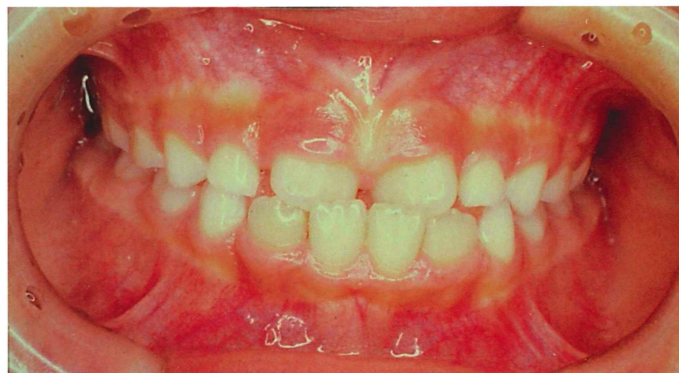
No. 2 写真